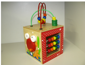
#253 Discovery Box