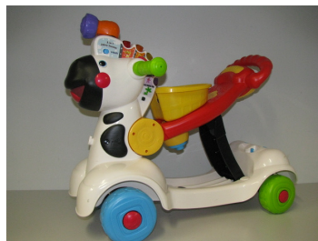
#1014 Zebra 3-in-1