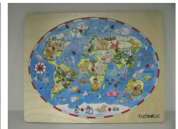
#557 World Puzzle